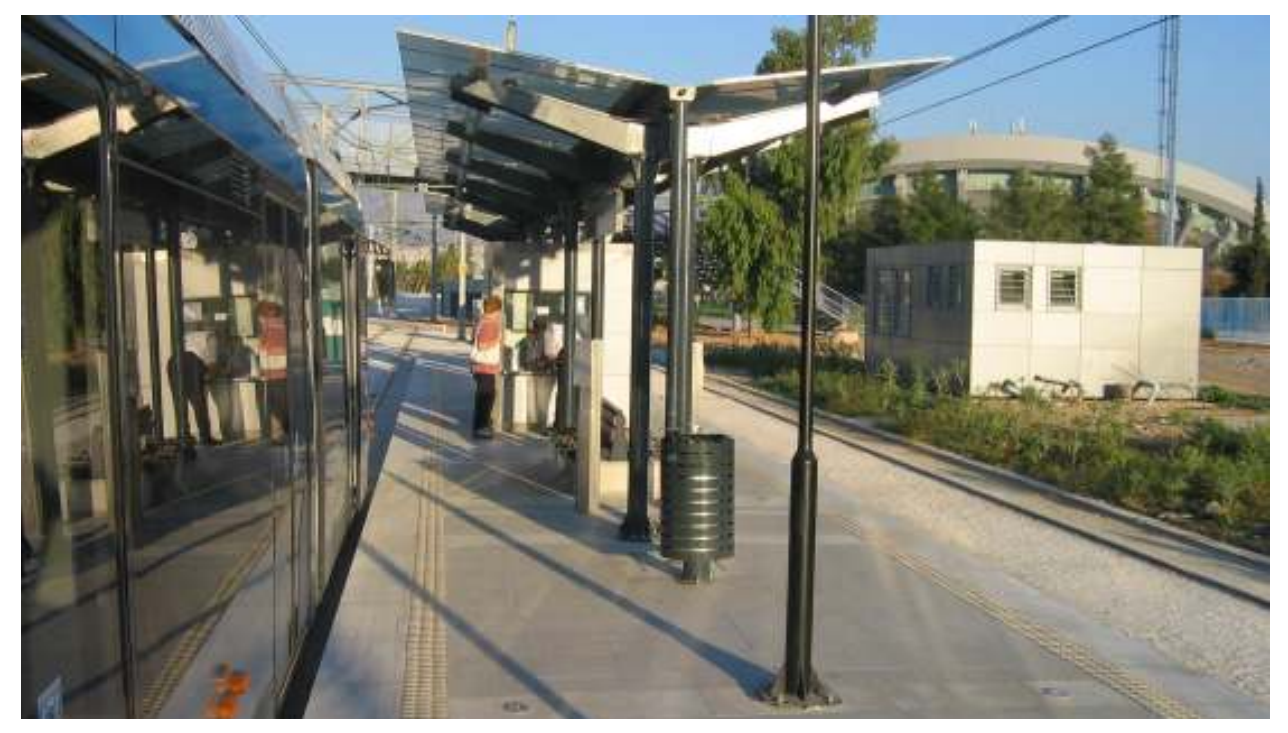
Neo Faliro Temporary Terminal Station